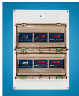
Multi-Channel B14 Receiver