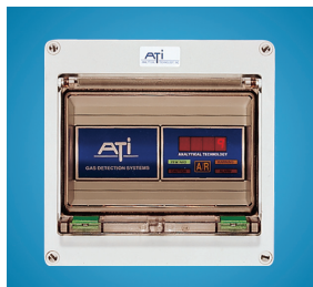
Single Channel B14 Receiver

If alarming and display is required, the B14 receiver can be used with either a single channel or multi-channel receiver system.